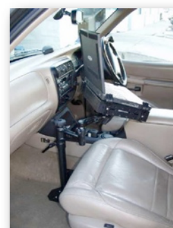
Fig 3: Optional Vehicle Mount

Practices without administrative staff can operate using mobile computers with one unit operating as the main system and additional users feeding into it.